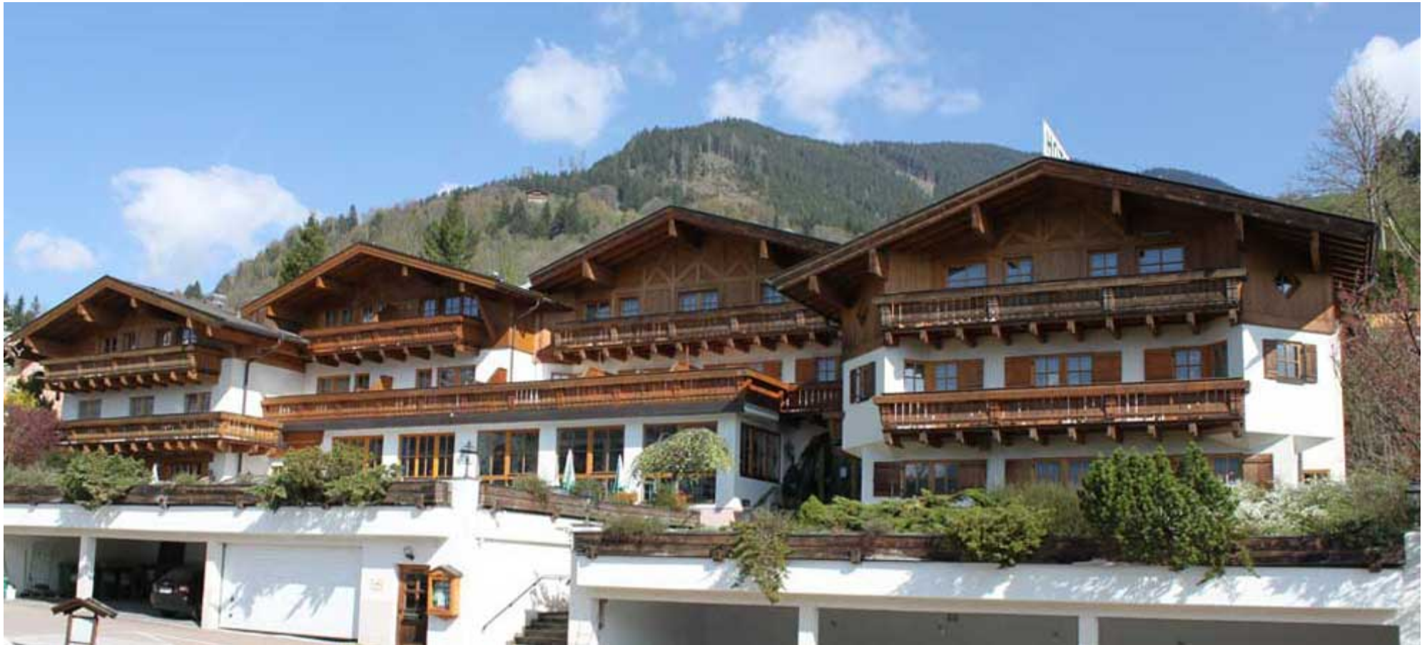
Private allocated parking spaces and an outside barbeque area