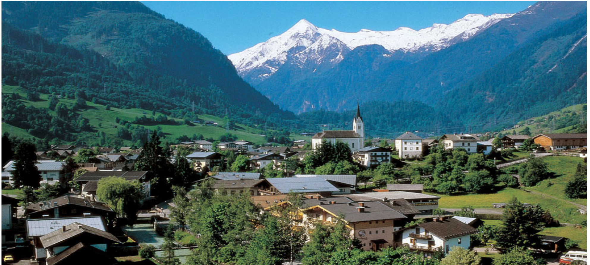
Kaprun with views of the mountains and Kitzsteinhorn Glacier