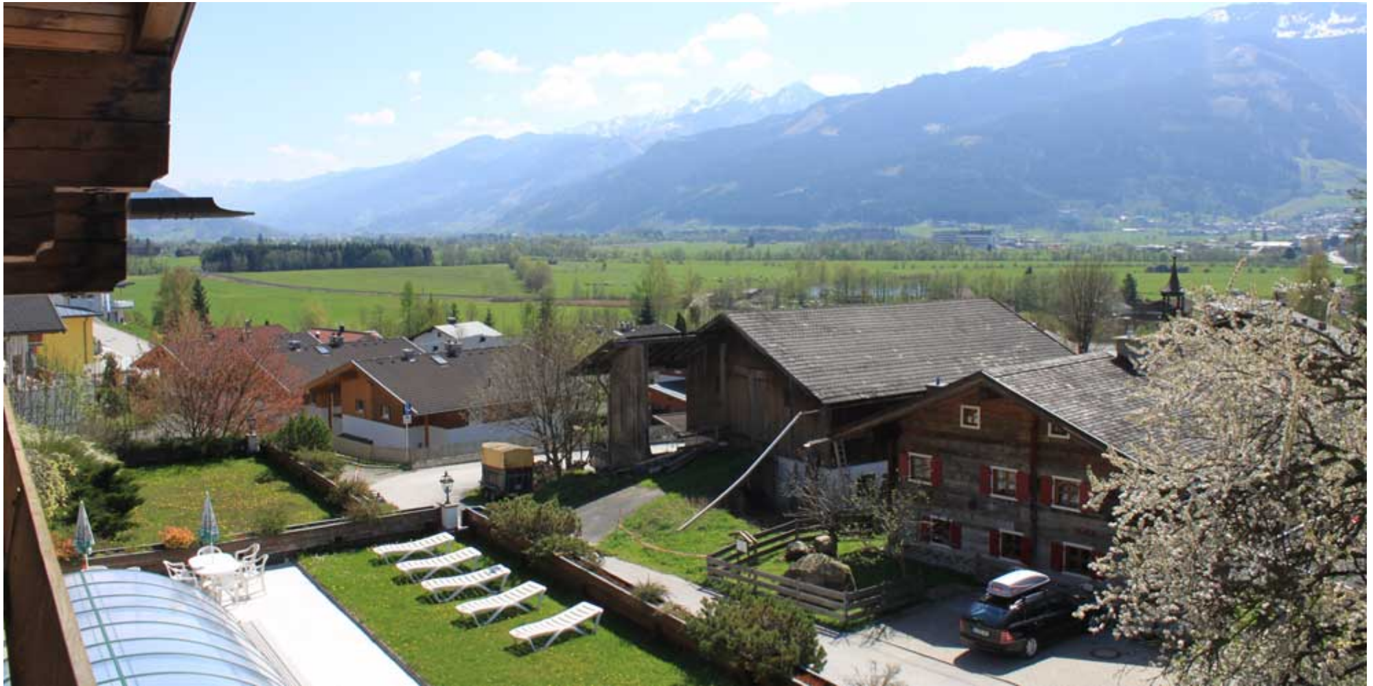
Beautiful views of the mountain range can be seen from Chalet Kristal